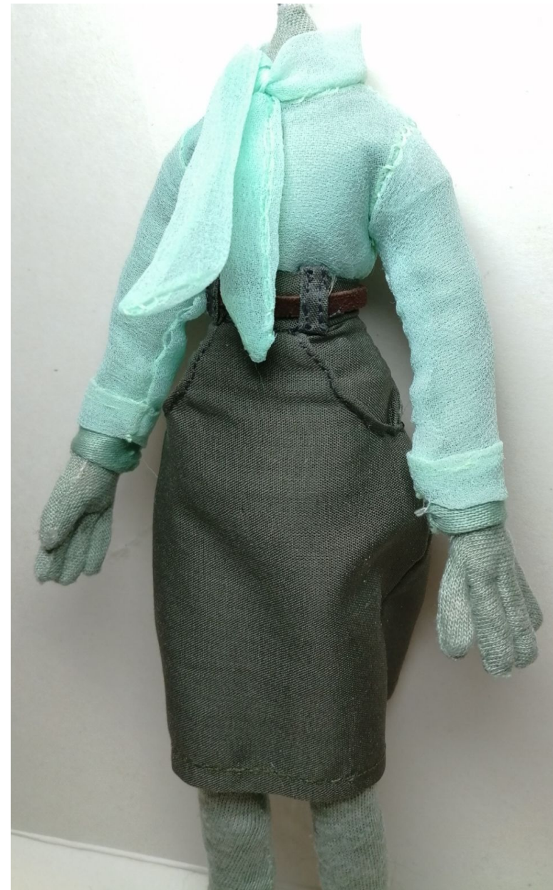
Night of The Living Dread Costume Design and fabrication