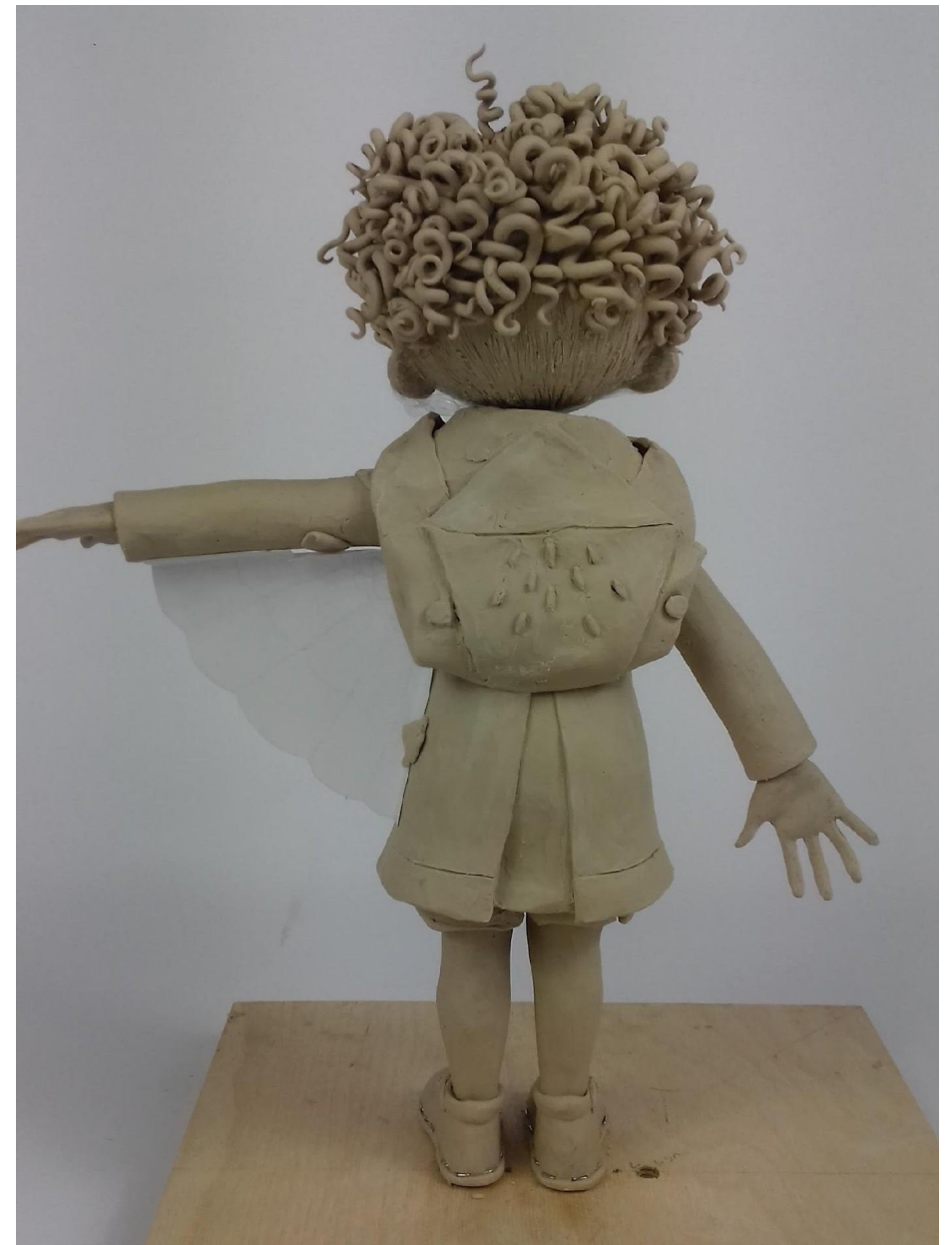
Puppet Project- Plasticine maquette of my character Littlebird