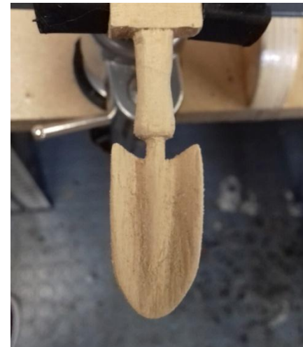
Props Module : Fish, cauliflower and door furnishings sculpted from Sculpey then moulded in silicone and cast in resin. Door made from MDF and plasticard strips, moulded in silicone then cast in resin. Trowel carved from balsa wood.