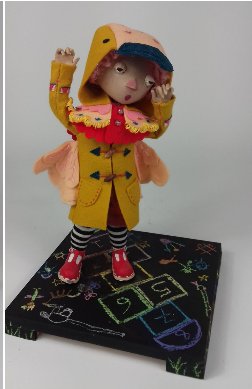
Final Littlebird Puppet- Hand embroidered costume with wired animatable wings and beak on a chalkboard base.