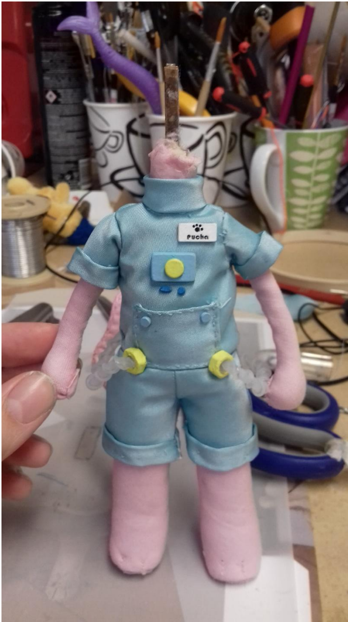
Meow or never Puppet costume fabrication and maintenance