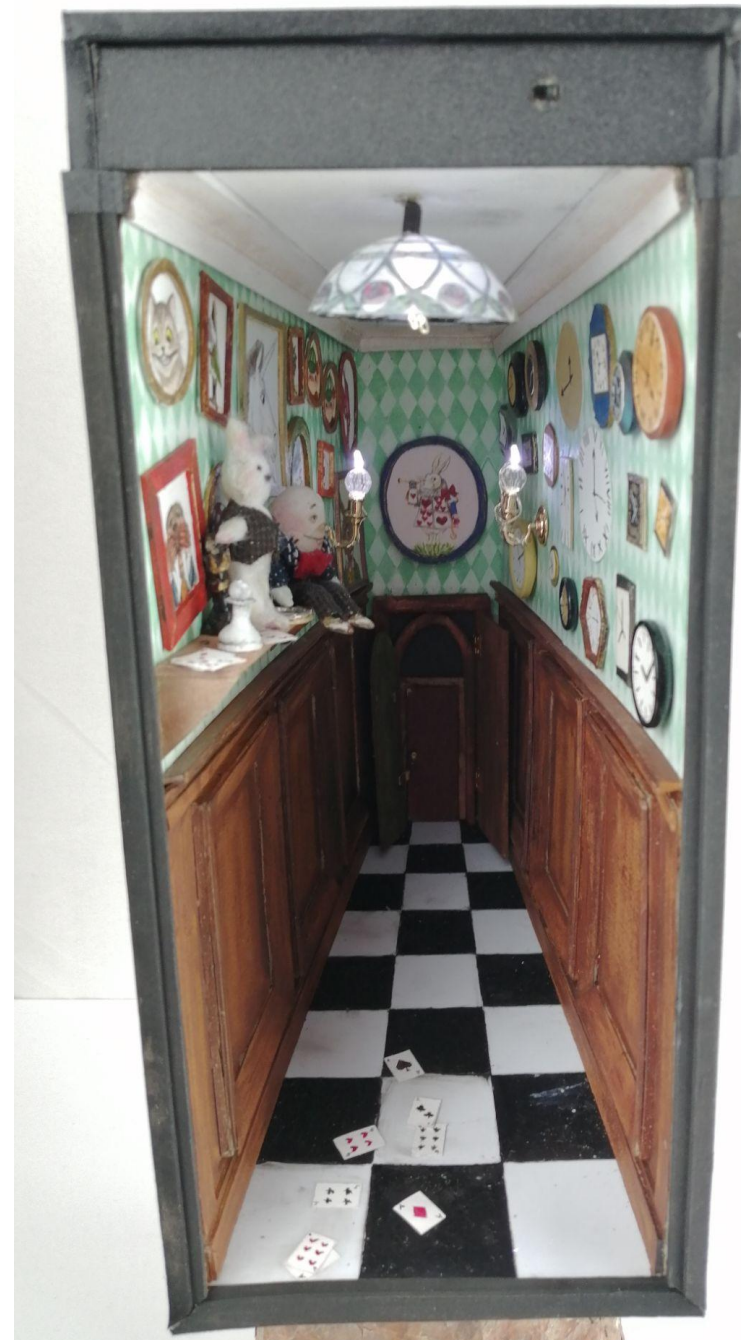
Alice in Wonderland Book Nook Commission- with functioning lights and poseable puppet