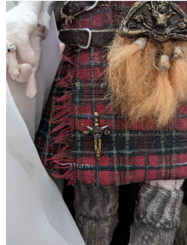
1/6th Scale Models for Wincott Wedding