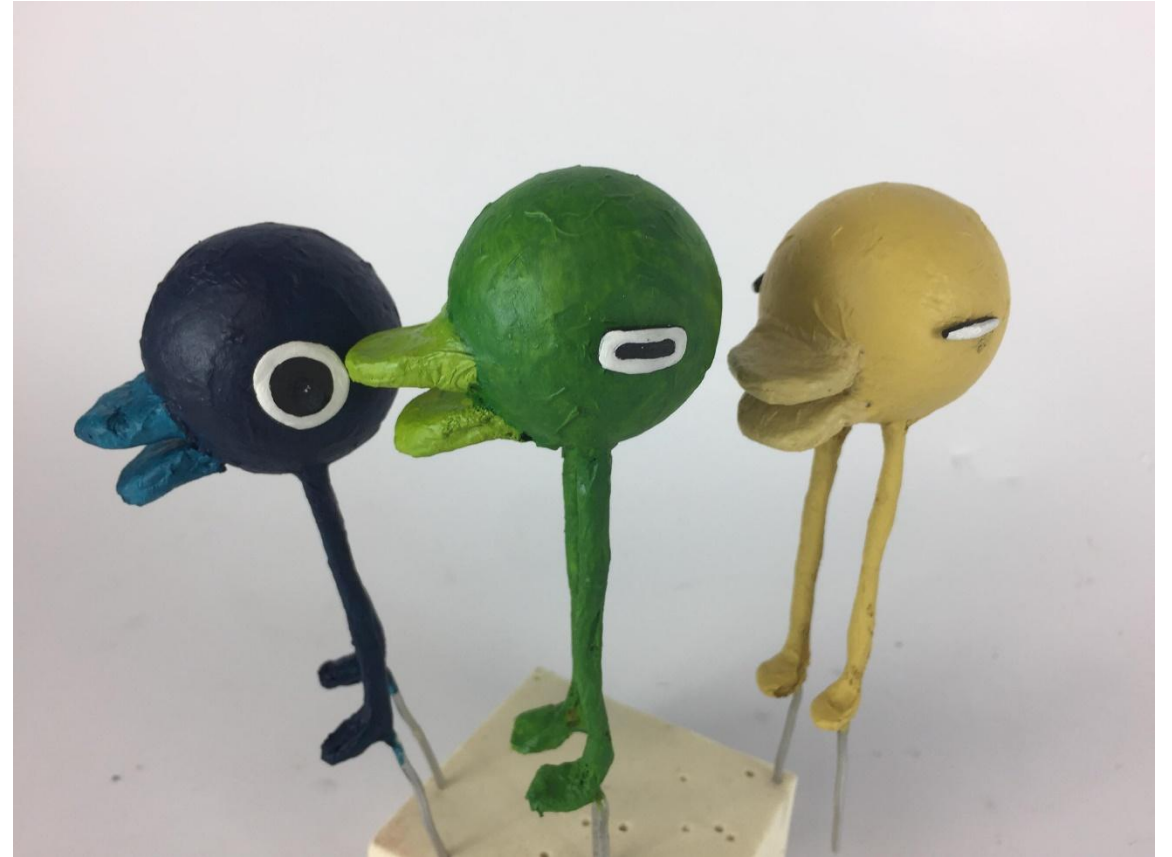
Critter puppets- polystyrene, sculpey, wire and papier mache