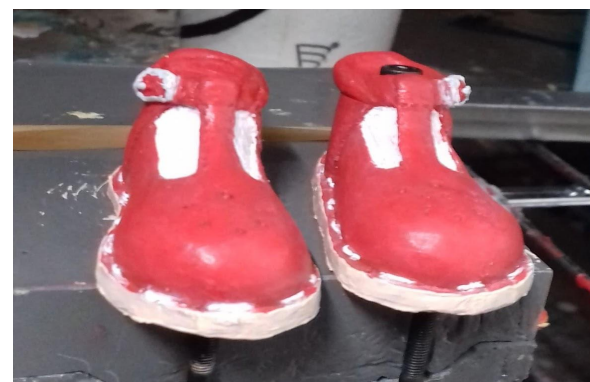
Puppet Littlebird- Chopped foam over ball and socket armature with fibreglass head, silicone hands and shoes and mohair wig.