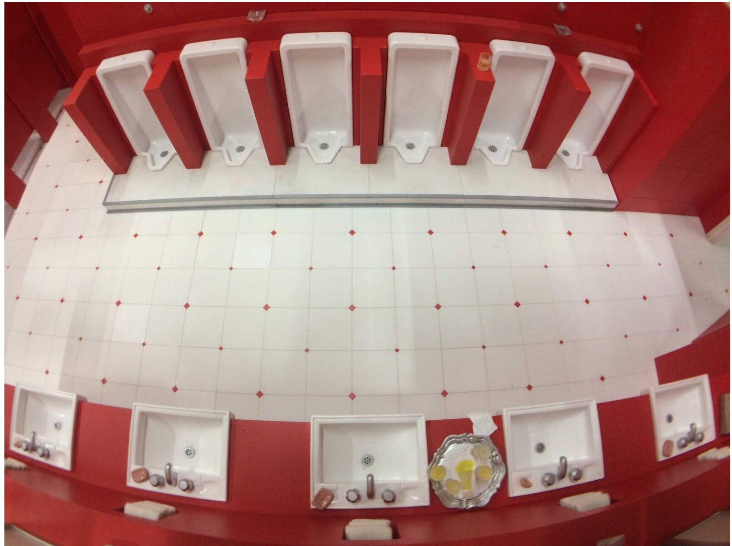
The Shining Replica Set Module- Collaborative Module Set build- MDF, scored plasticard flooring with plasticard diamonds inserted, plasticard walls